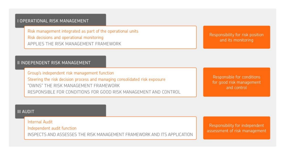
THREE DEFENCE LINES OF RISK MANAGEMENT

The first line consists of risk management applied within business and other operations. It supervises risk decisions and ensures that risk exposure and risk-bearing capacity are under sufficient Group-level control. Risk management is included in business models and processes.